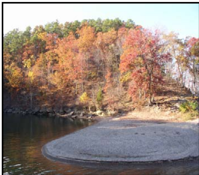
PICKWICK LAKE IN FALL