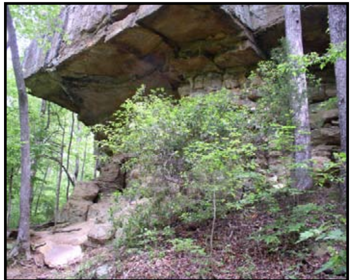
TOWERING CANYON WALLS