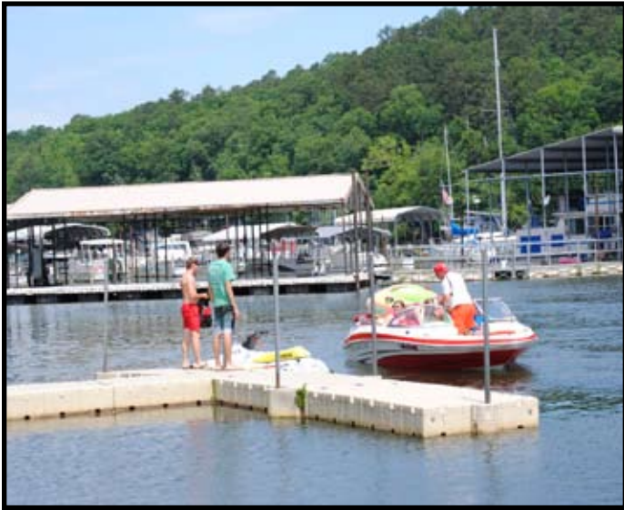
BOATS, BOATS, & MORE BOATS