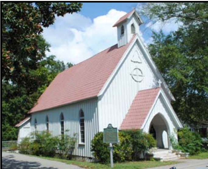
IUKA WEDDING CHAPEL