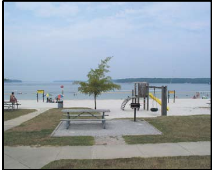
BAY SPRINGS BEACH & PARK