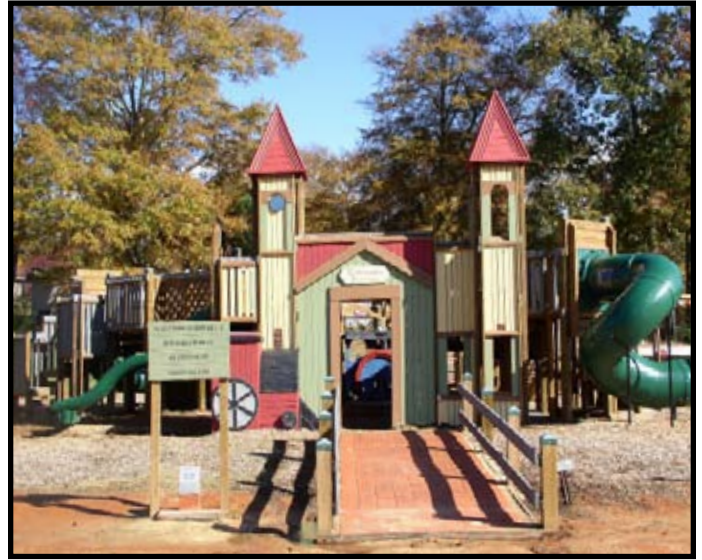
BELMONT CHILDREN'S VILLAGE