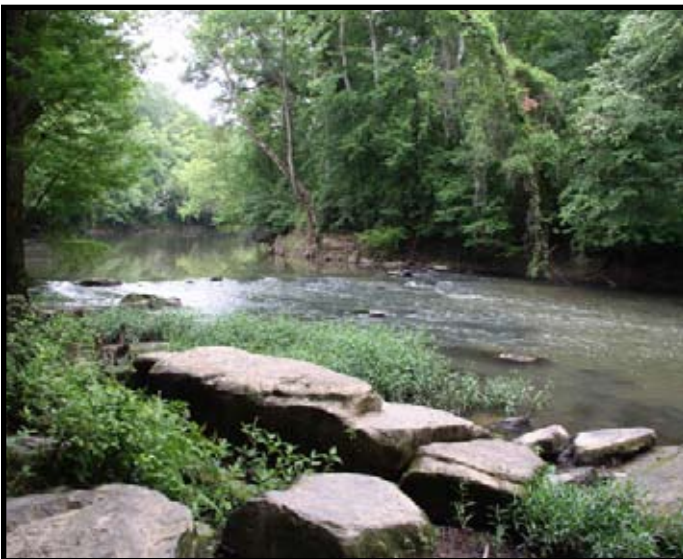
ROCKY SHOALS ON BEAR CREEK