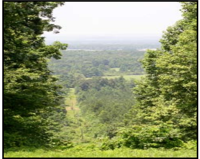
VIEW FROM THE TOP