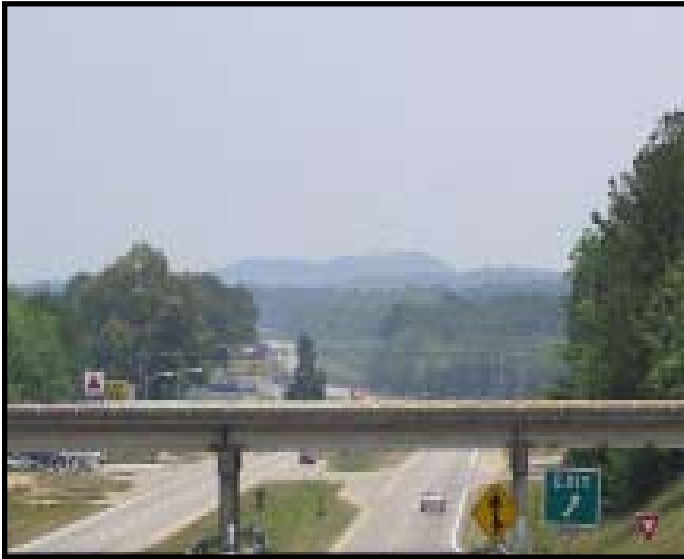
WOODALL MOUNTAIN FROM BURNSVILLE