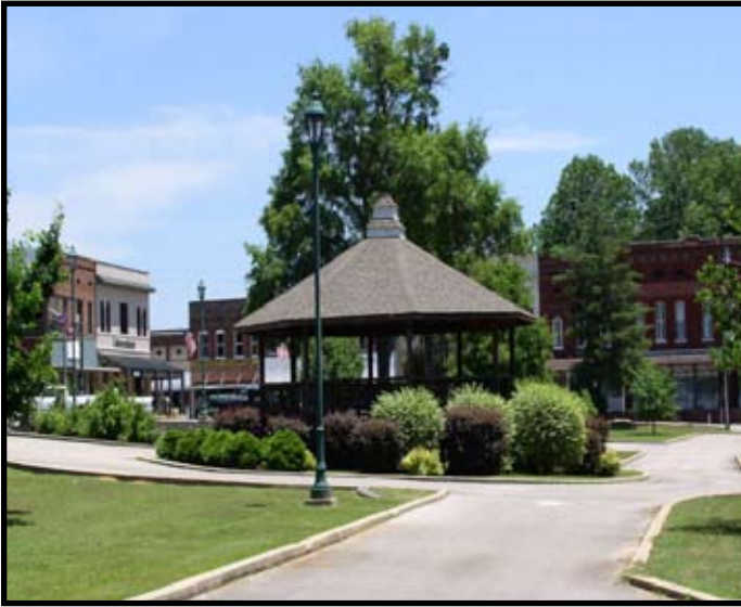
DOWNTOWN IUKA JAY BIRD PARK