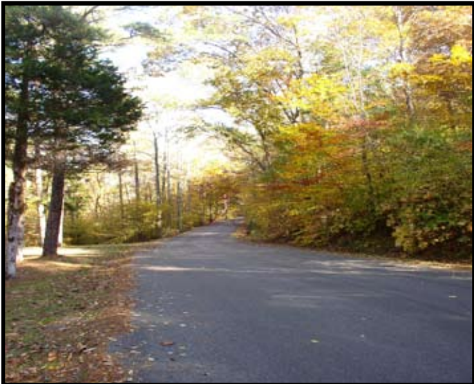
FLOWERING SHRUBS & TREES