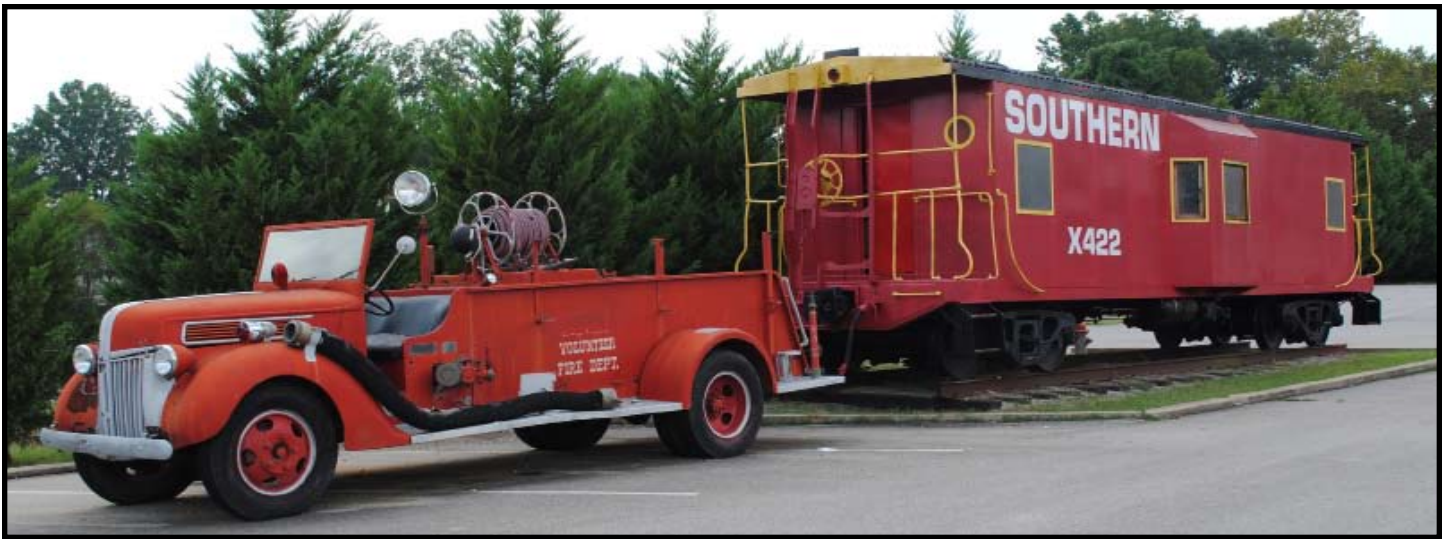
ANTIQUE FIRE TRUCK & RAILROAD CABOOSE