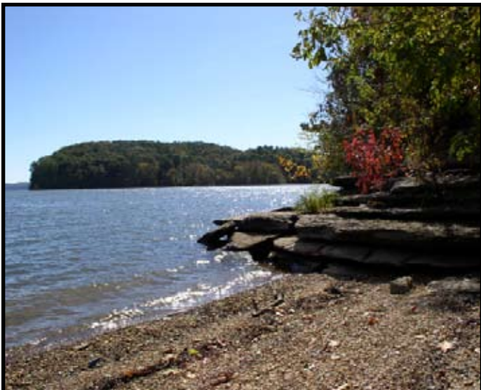
ROCKY BEACHES AND ROCK OUTCROPS