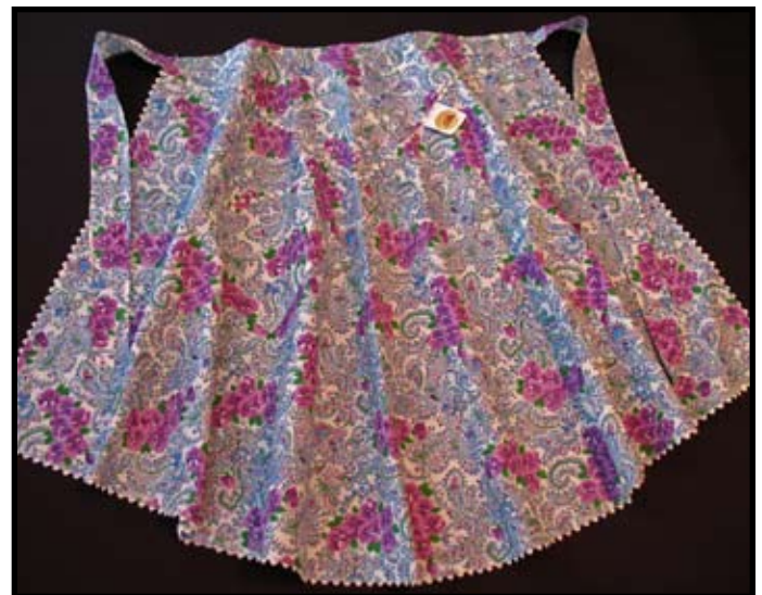
AMERICA'S ONLY APRON MUSEUM