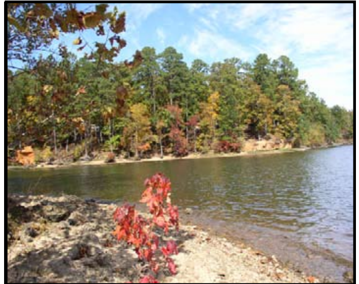
SECLUDED COVES & CAMPING AREAS