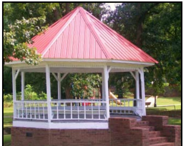
SHOOK PARK PAVILION