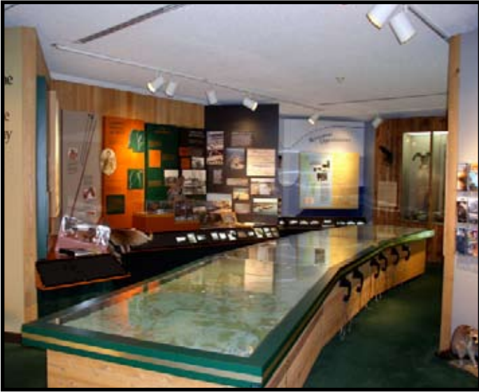
VISITORS CENTER & MUSEUM