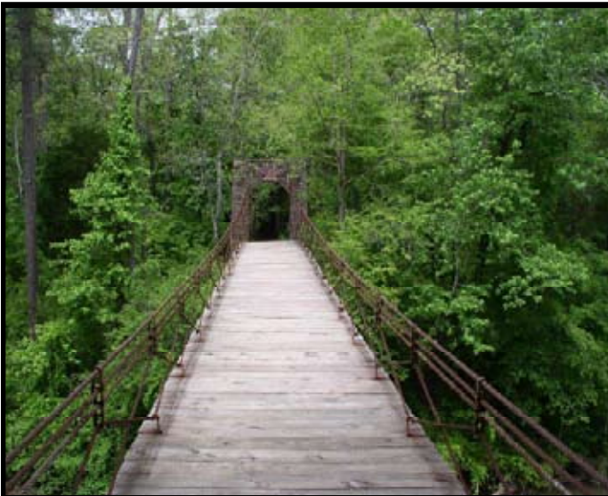
TISHOMINGO STATE PARK