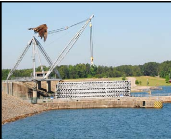
BAY SPRINGS LOCK & DAM