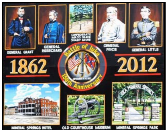
BATTLE OF IUKA MURAL