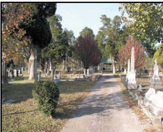
OAK GROVE CEMETERY