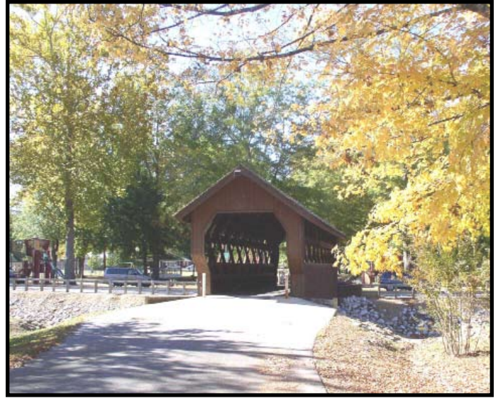
IUKA COVERED BRIDGE