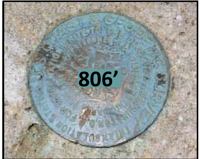
HIGHEST POINT IN MISSISSIPPI AT 806'