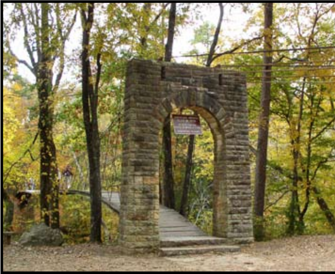
SWINGING BRIDGE OVER BEAR CREEK