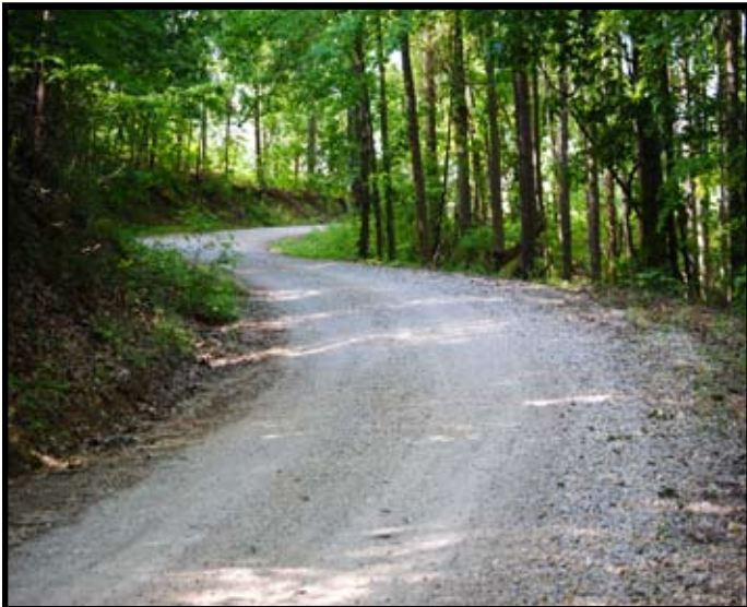
ROAD TO THE TOP