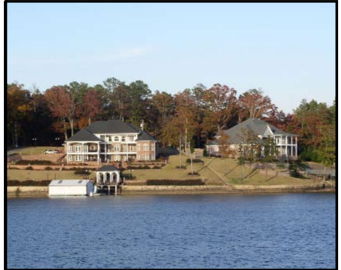
HOMES ON PICKWICK LAKE