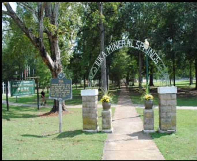
MINERAL SPRINGS PARK