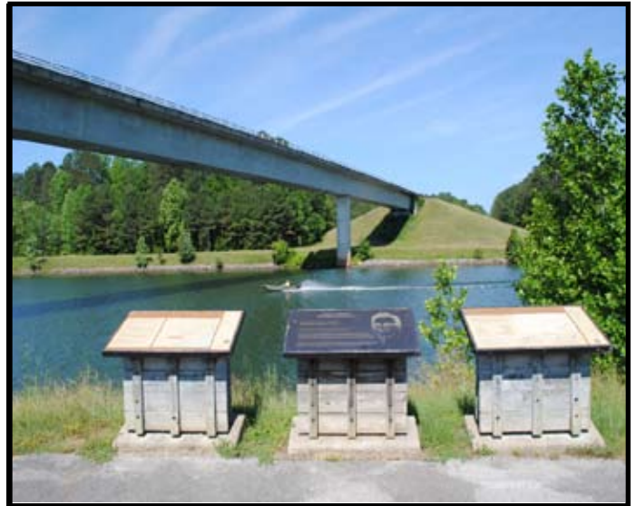
TENN-TOM WATERWAY OVERLOOK