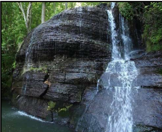
COOPER FALLS (BY BOAT ONLY)