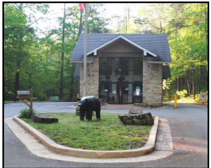
PARK ENTRANCE & CONCRETE BEAR