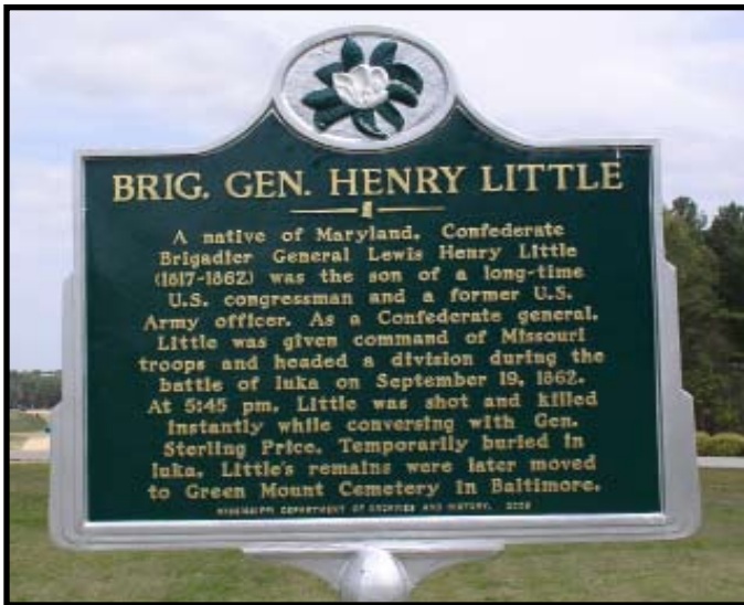
BATTLE OF IUKA DRIVING TOUR