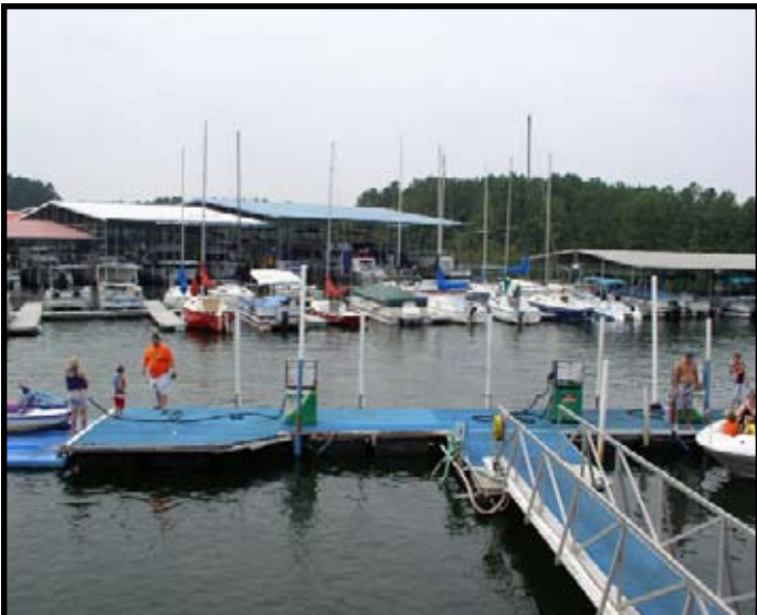
BAY SPRINGS MARINA