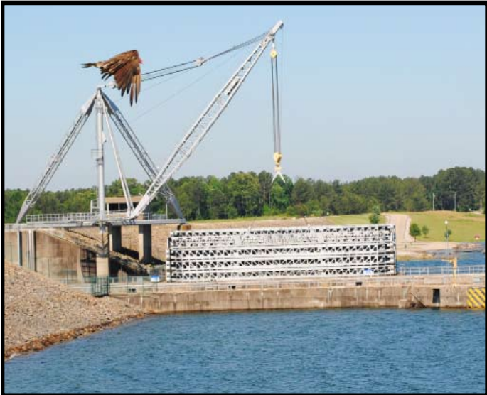
BAY SPRINGS LAKE LOCK & DAM