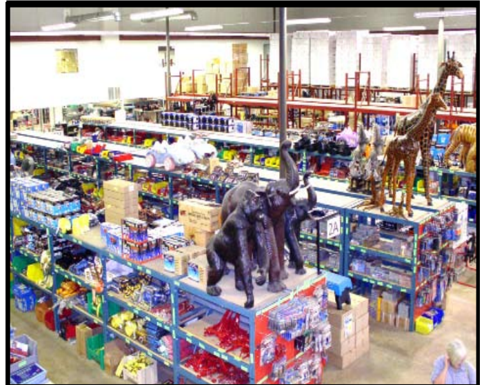
BARGAIN CAPITAL TOUR