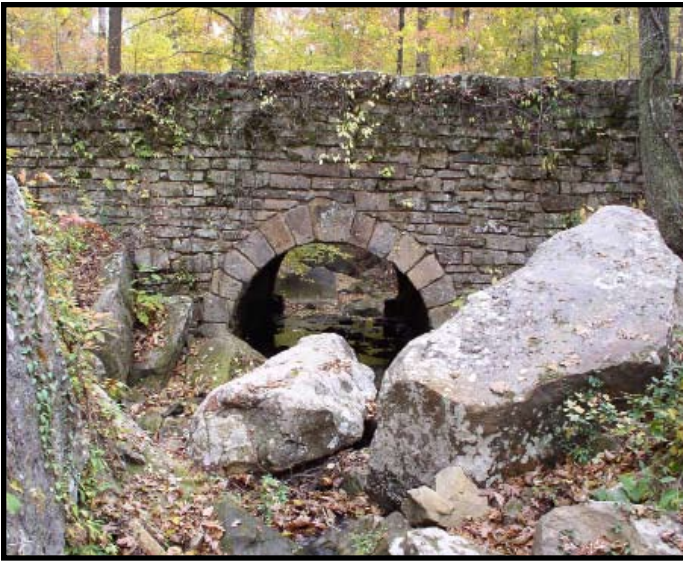
NATIVE STONE ROCKWORK