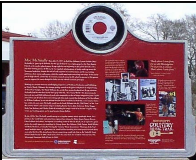
MAC MCANALLY MUSIC TRAIL MARKER