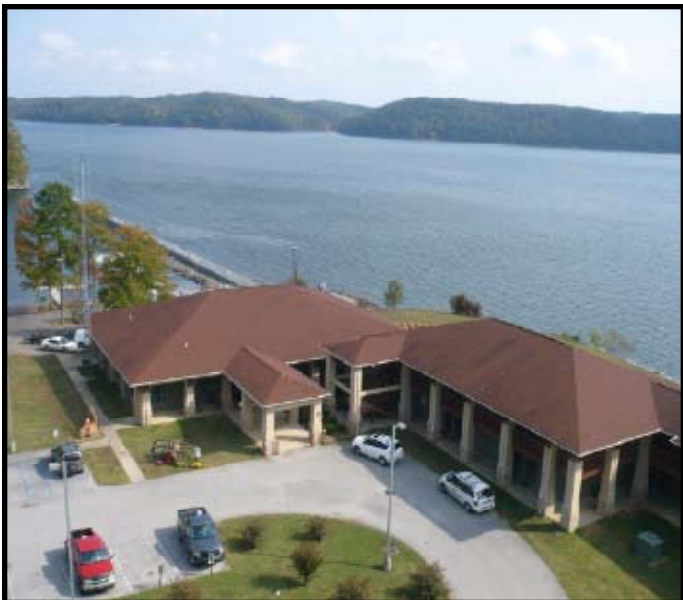
J. P. COLEMAN'S HOTEL OVERLOOKS THE SPARKLING WATERS OF 43,000 ACRE PICKWICK LAKE