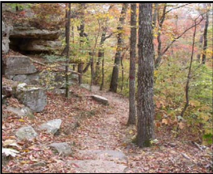
13 MILES OF NATURE TRAILS