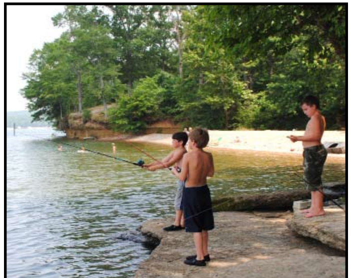
FISHING ON PICKWICK LAKE