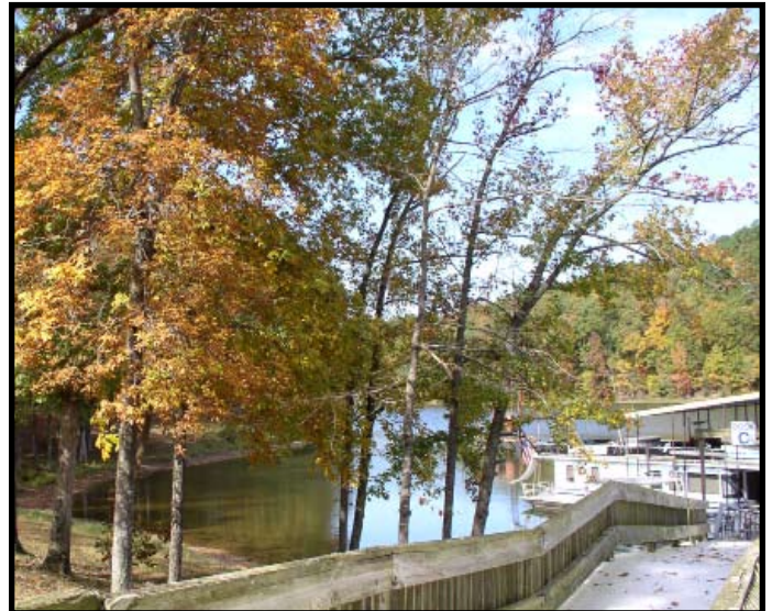
MARINA IN A COVE