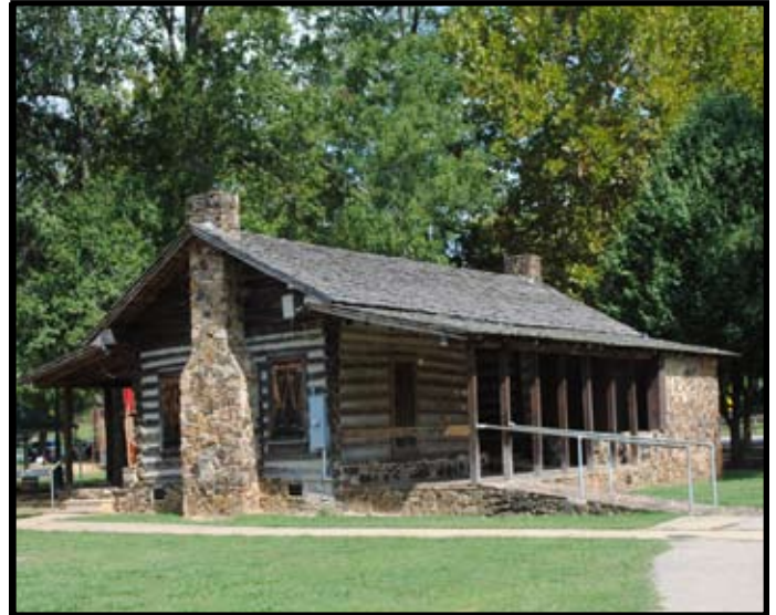
IUKA PIONEER CABIN