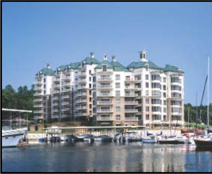
GRAND HARBOR MARINA & CONDOS