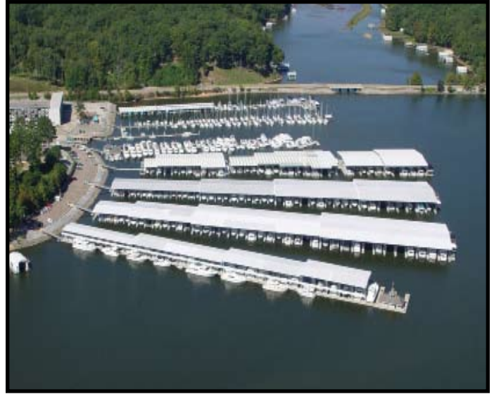
AQUA YACHT HARBOR