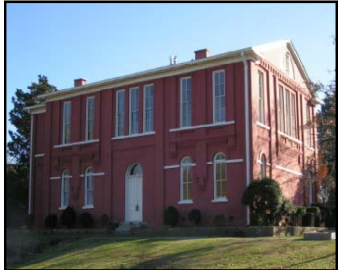
OLD COURTHOUSE MUSEUM