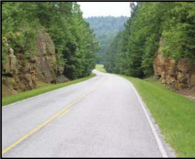
NATCHEZ TRACE PARKWAY