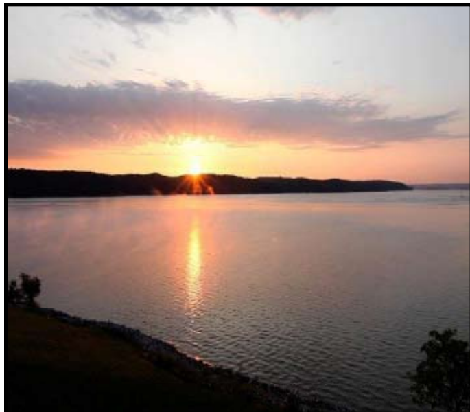
SUNRISE OVER PICKWICK LAKE