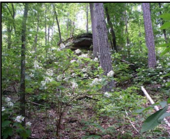
600 SPECIES OF FLOWERING PLANTS