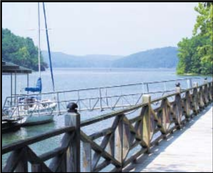
UNION HARBOR MARINA