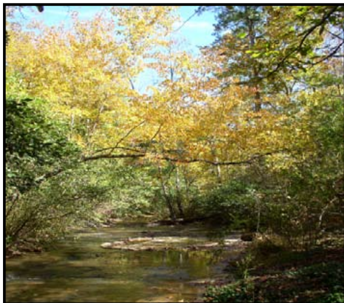
ROCKY STREAMS AND FALL COLOR