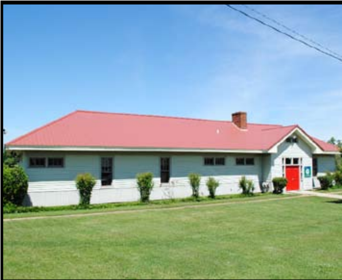
BELMONT RAILROAD DEPOT